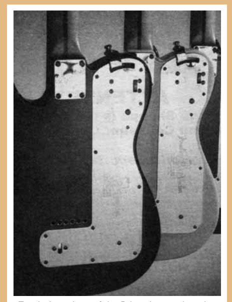
Fender's verison of the B bender requires the guitar's back to support a metal plate.